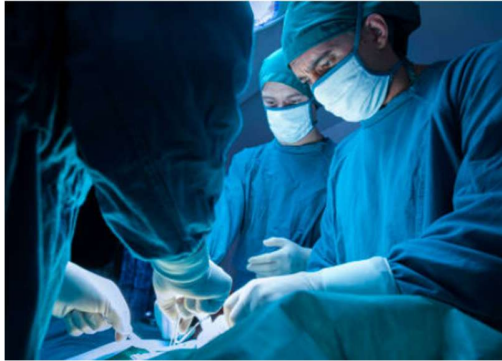
Spine procedure in process